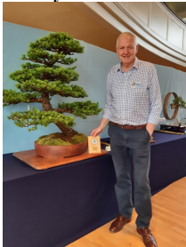
This Japanese larch was displayed at the SBA show in 2023