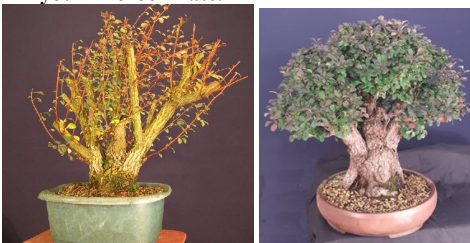
This is a Berberis, collected from a demolition site in 2011

I'm not sure that recommending books is the best advice that can be given nowadays. There is so much information on YouTube and it's much easier to consume. However, a word of caution. Any knowledge gathered from books, or the internet, has to be taken with a degree of caution. The majority of authors will share knowledge based upon their own experience of working with trees in their local environment. Each of us has a unique micro climate in our garden and thus the advice offered from people at the opposite end of the country, will not always translate into sound advice for the trees in your microclimate.