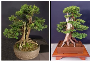
A couple of substantial Yew trees, both with extensive carving, the one on the top is still in development, the one on the bottom being displayed at Bonsai Live.

I have quite an eclectic mix of tree species. Mostly Scots Pines, Junipers and Cedars. There are a few Yews, Larch, Hawthorns and Maples to mention just a few. There has been no desire to specialise, but I have found that these are the varieties that survive in my environment. I do not have a greenhouse or polytunnel, and being away at work throughout the week means that my trees need to be reasonably robust and self-sufficient. Most of my trees would be considered medium to large scale, and I don't have any Shohin or Mame sized trees. I have struggled to keep Japanese Pines alive and although these may be regarded as iconic standard bonsai varieties – I now advise newcomers in my part of the world to avoid them and to encourage the use of native species or those available in the local garden centre.