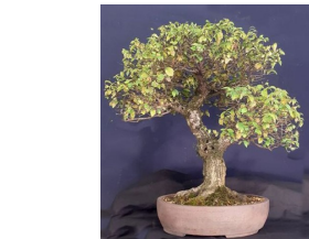
A Siberian Elm, with a fantastic nebari, purchased as raw material in 2010